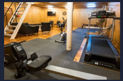
Top Lounge for lectures and fun